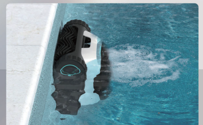
Wall Cleaning Capabilities