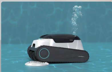
Caterpillar Treads for Superior Mobility