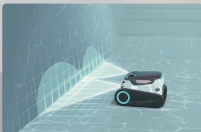
Infrared Obstacle Avoidance